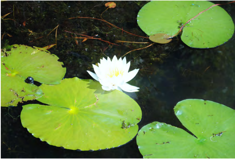
There are three plants in the photo. Lily, coontail and Hydrilla. The hydrilla needs to be addressed first. The quicker you discover it, the earlier you can treat it and the cheaper the treatment is.