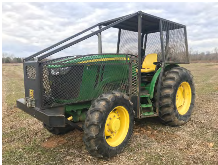
Tractors with enclosed cages and skid plates are ideal for using in the woods.

Another question managers often have is when or what time of year should burning be conducted? As I stated previously, you may only have a handful of good burn days or other time constraints that hinder you. We typically start in late November after a frost through the end of March before nesting initiation generally takes place (this is primarily dormant season fire in our neck of the woods). One concern is burning during deer season, but from my experience, prescribed burning has not negatively affected deer hunting to justify delaying burning until after deer season. When burning on a 2- or 3-year rotation in the Deep South, there will still likely be a vertical hardwood component left standing after a burn that would still provide enough cover to hold deer (unless a herbicide treatment