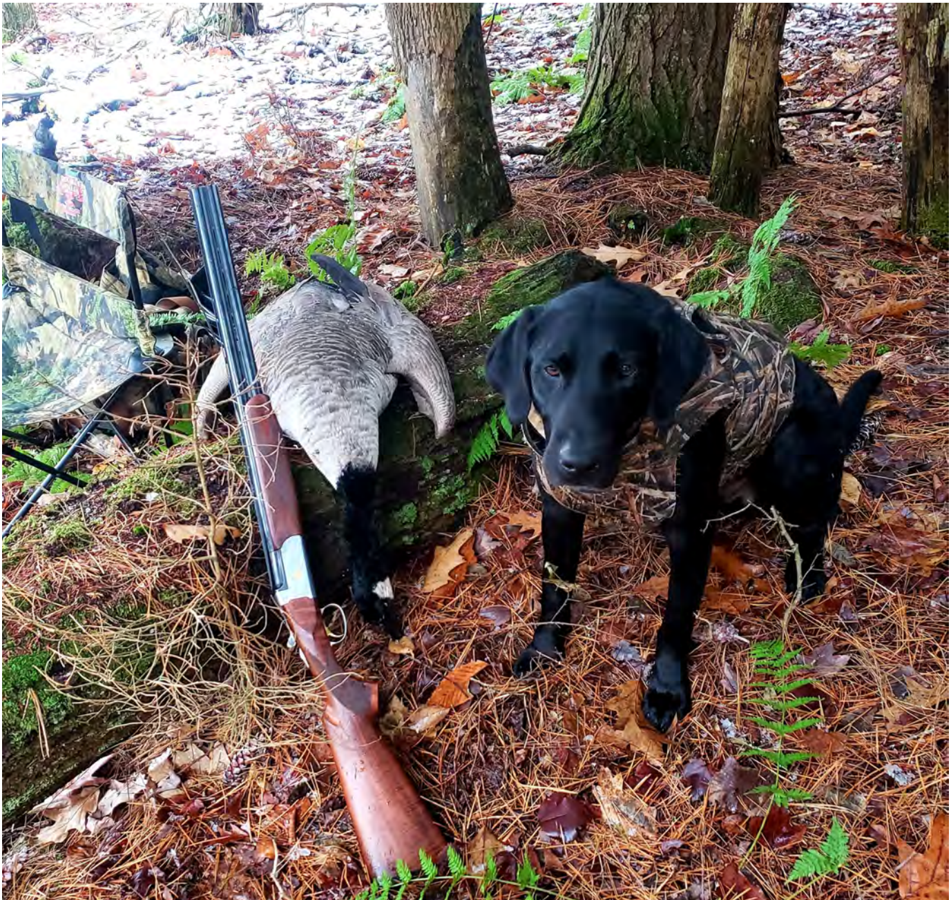
Ducks and geese love vegetation! There are plenty of high-quality native plants to establish in your waterbody and not allow exotic or invasive species to take hold.

acre) for herbicide only, not including application. There are state and federal programs that assist landowners with costs to treat exotic and invasive plants. If your waterbody experiences an exotic infestation and it drains into uninfected public waters, some funding may be available through your state's agricultural or environmental protection agency. It only takes a few minutes to call, and it could help defer costs. When performing an