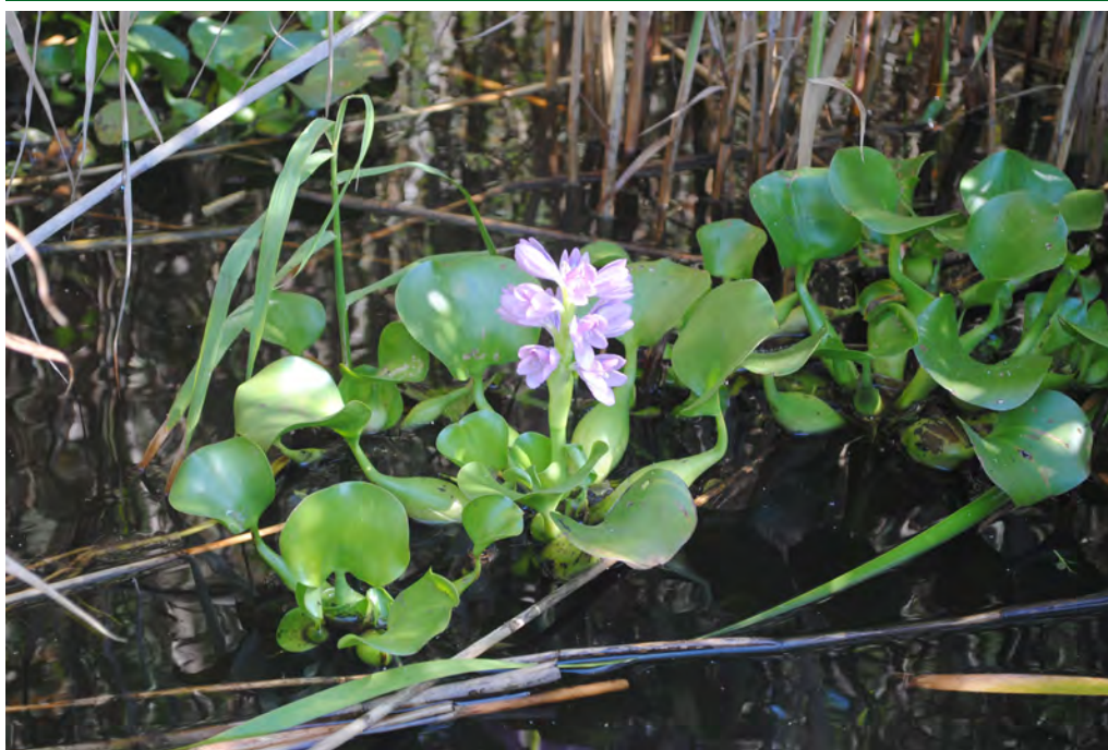
Exotic plants can come in all shapes and sizes. This non-native water hyacinth is often misidentified as pickerelweed. Letting it grow can soon create a nightmare for a lake owner. But leaving the native, pickerelweed will enhance both your waterbody's fish habitat and aesthetics.

A nglers and lake owners have expressed their likes and dislikes for different kinds of aquatic plant species. You can always start an argument at any boat ramp or with a landowner over what's the best aquatic vegetation (aka lake weeds) for largemouth bass. Back in the 80's I met people that moved Hydrilla around from public lake to public lake, and even took it back to their own ponds. They knew it grew big bass, but they didn't know the other issues and expenses it brings. And don't even ask a waterfowl biologist or duck hunter (which I am) about Hydrilla, they both give a resounding "Hydrilla is great!" when talking about waterfowl habitat.