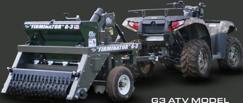
G3 ATV MODEL

RANEW'S OUTDOOR EQUIPMENT offers the ideal equipment to make food plot planting easier and more effective. The Firminator is the best all-around equipment for hunting food plots and deer management. Ranew's is ready to serve all hunting and land management needs across the USA.