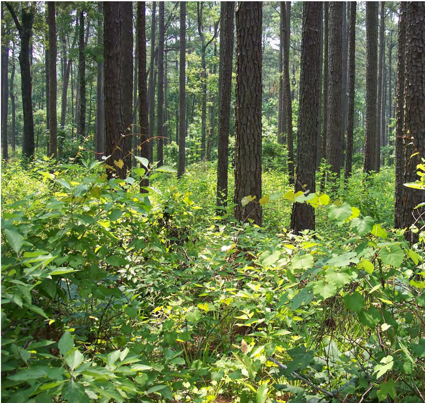
Prescribed fire is one of the most effective and cost-efficient habitat management tools available to increase, improve, or maintain natural habitats

ity fruit earlier and continue to bear efficiently as they mature. The optimal time to prune fruit trees is during the dormant season, when stress on the tree is minimized and structural issues are easier to identify. That said, diseased, damaged, or dead branches should be removed whenever they are observed to prevent the spread of problems. Regular, incremental pruning on an annual basis is key