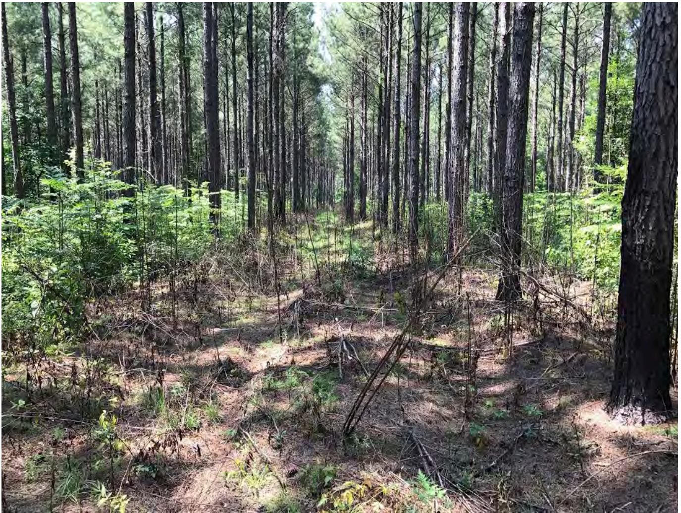
Thinned-row sprayed with Escort XP to reduce overabundance of devil's walkingstick following a dormant season burn. This picture was taken in mid-July, about 2 months after the herbicide application in mid-May. Grasses present were unaffected by the herbicide, and forbs are starting to colonize again.

has previously been applied, but more on that later!). Now, if you are interested in holding turkeys, start burning stands off through the winter and early spring. You may have the problem of “not knowing which bird to go to” come opening day! With that said, there is nothing wrong with waiting to burn a stand in March if that is what works best for your situation. Everybody has that stand or two down in the “honey hole” that there is always a bird hanging around that you may want to immediately attract with a clean burn just before turkey season. I know we do!