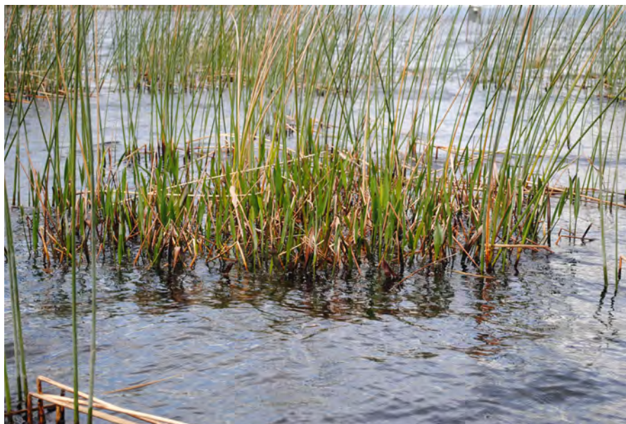
This recently planted area of bullrush and pickerel weed will provide quality fish habitat and probably never need treating with herbicides. They are both highly beneficial and rarely become an issue.

recommend Google Lens and the Picture This apps to help you identify plants, both aquatic and upland. Plants can be treated with herbicides, biological treatment (bugs or fish) or mechanically removed. Sometimes a combination of two or all three techniques should be implemented. For Submerged vegetation, such as