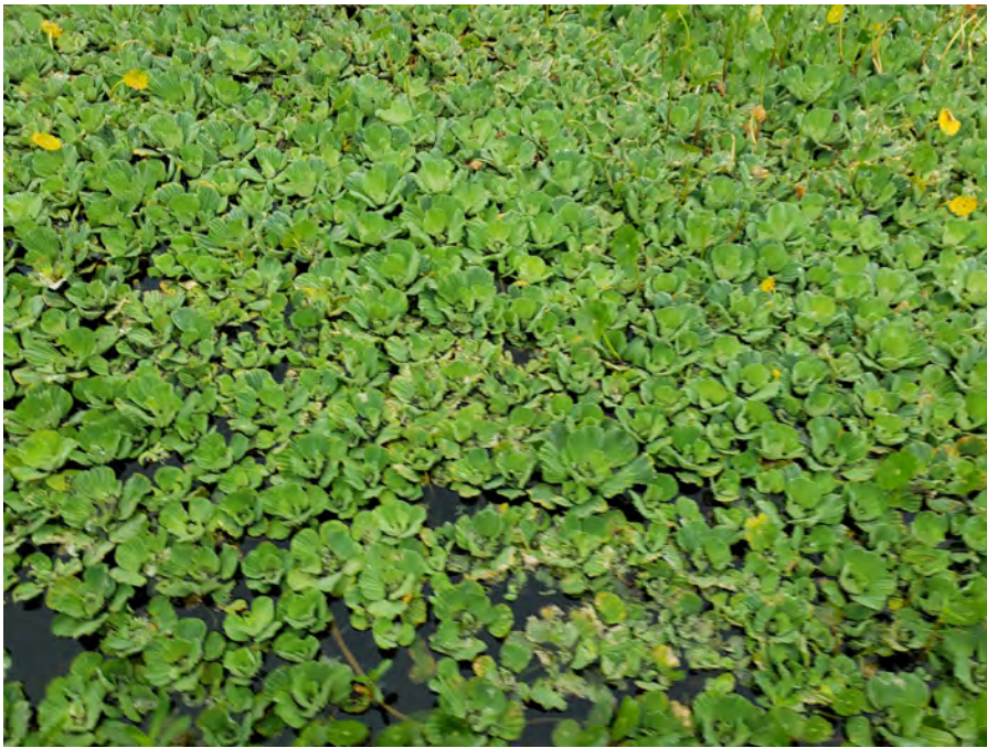
This exotic water lettuce is a free-floating exotic plant that grows very quickly. Once identified, research the herbicides that work best and treat as soon as possible.

be required, which is very difficult, and to remedy the problem they caused.