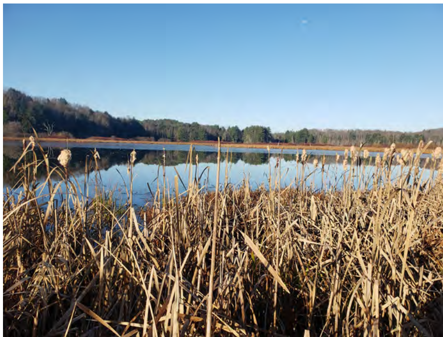
Although cattails are native, they are invasive, and need to be managed properly as to not become a major problem.

Once you get an exotic species, you need to be diligent and thorough with the response/treatment. Identifying the exotic species, researching the treatment options and knowing the plant's biology is important. Miss-identifying a plant or applying an herbicide that does not work on that particular species can be costly. We recommend the Texas A & M University and University of Florida's aquatic plant identification web sites for identification, biology and treatment recommendations. If your lake is in northern climates, check your state university, fish and game department, county extension office, or herbicide distributor for plant ID assistance. Also, we