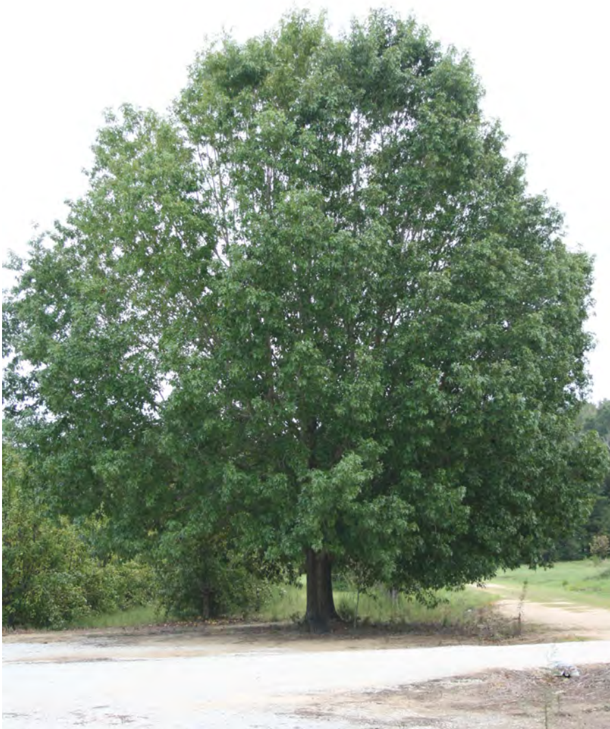
15 Year Old Nuttall Oak, started producing acorns at 8 years