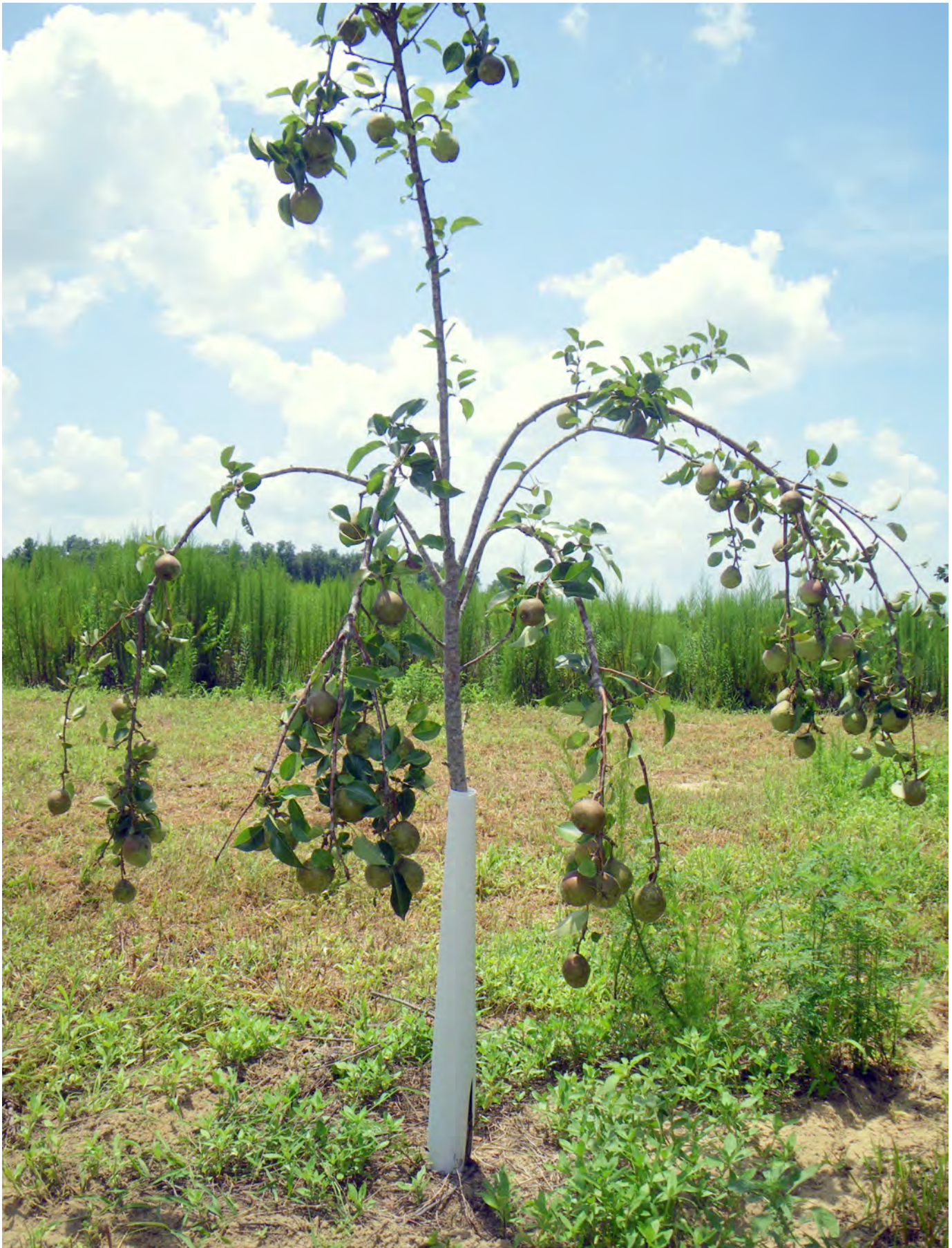
Pruning young fruit trees is critical to ensure proper growth and development of a solid structure.