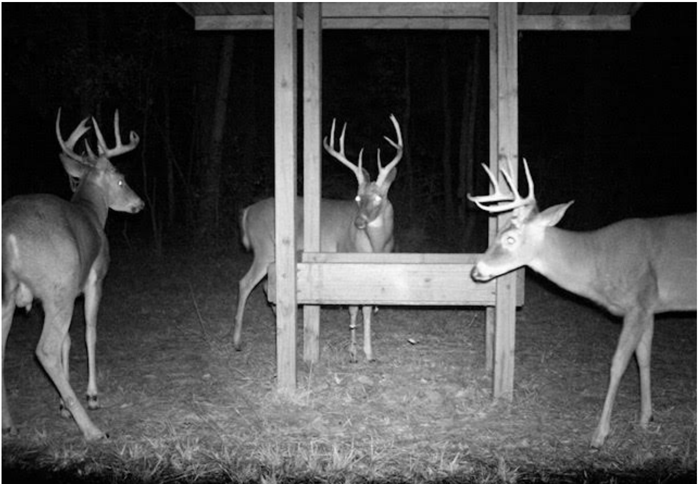
Late winter through spring green-up is one of the most nutritionally stressful periods for deer across much of their range. Providing nutrient-rich supplemental feed offers deer a reliable and available food source during this period.

option, I encourage considering the transplanting of native plants already present on the property. These plants are well adapted to the site's soils and climate, typically establish more successfully, and come at no cost. When selecting plants, prioritize species that are evergreen or provide year-round screening. Species that have proven successful include wax myrtle, broomsedge grass, various holly species, and ferns. When transplanting, it is important to keep as much of the root ball intact as possible. Leave ample space around the base of the plant and cut a wide circle with a shovel, gradually working deeper and beneath the plant until the root mass, along with the surrounding soil, can be removed. Handle the root ball care-