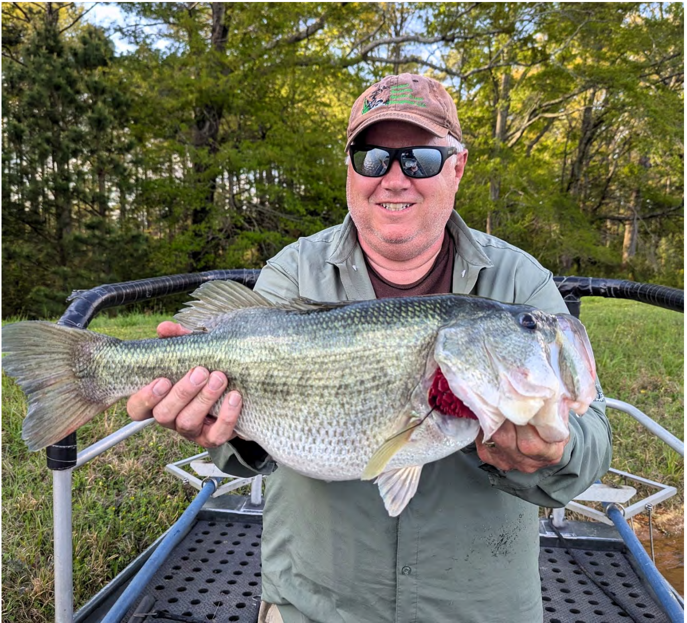
To grow quality largemouth bass, you need some quality vegetation. Allowing native non-invasive plants to grow in and around your lake will greatly help the water chemistry and fish population.

tions they stay in check and are beneficial. I never use the term eradicate, because it is almost impossible to eradicate an animal or plant species. Once you get an Invasive Exotic plant in your waterbody, keeping it controlled is the objective. Lots of plants disappear for a while, but due to seeds, tubers, roots or upstream re-infestation that continually feeds your waterbody, they eventually come back.