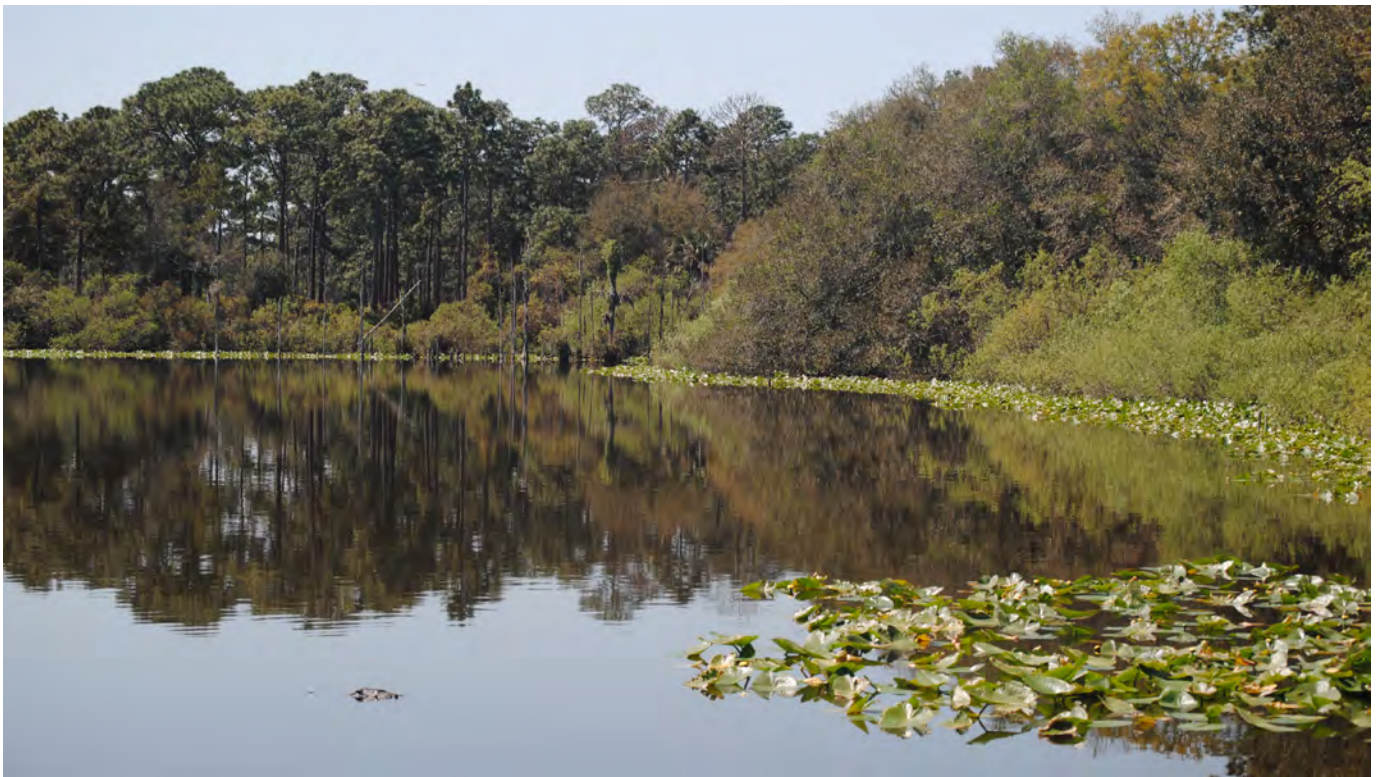
Properly identifying your plant species, knowing it's biology, and knowing the three methods of control (mechanical, biological and chemical) makes for a much easier time managing the aquatic plants.