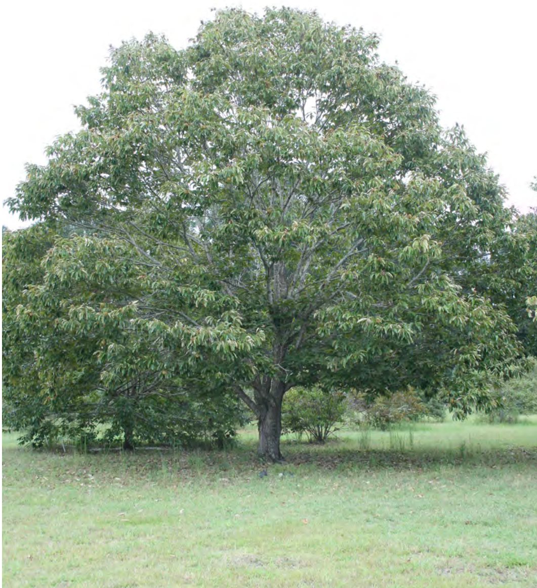
15 year old Chinese Chestnut, produced over 250 pounds of seed each year for last 5 years.