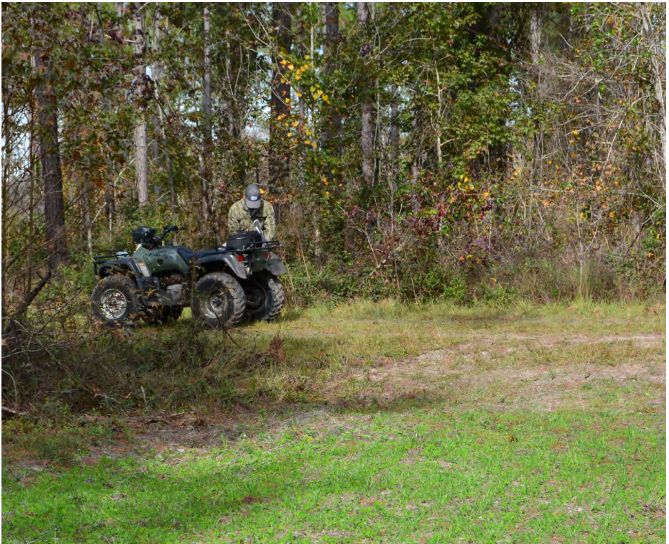
Late winter is a great time to assess your program and develop a plan that will improve hunting and enjoyment of your property.

tions, we review projects completed in the previous year, evaluate harvest data and other relevant information to understand how wildlife is responding to management, reassess progress toward established goals, and evaluate the property to identify limiting factors. From this process, we develop a prioritized list of management actions designed to move the property closer to the landowner's objectives. While this is a professional service we provide, the underlying process is one I believe every landowner should undertake annually—whether working with a professional biologist or not.