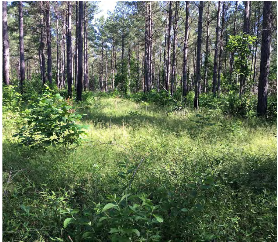
Thinned-row spraying with Escort XP primarily to reduce blackberry, sweet gum, and beautyberry. The stand was burned in February 2016 and then sprayed June 2016. This picture was taken in May 2017. Look at the lasting herbaceous response.

Managing quality turkey habitat in the Deep South is no walk in the park! It takes a good deal of time, effort, and patience. However, it is extremely rewarding when it all starts to come together. From a habitat perspective, fire , herbicide , and proper timber management are three of the most valuable tools in managing quality vegetation diversity and structure for turkeys in southern piney woods. Quality turkey management is a continuous learning process and will never be completely figured out, but since we seriously started implementing patch burning, thinned row spraying, and strategic timber management, our turkey survey results have shown about a 30% increase over the past few years. Hopefully, by using or modifying these techniques to best fit your management scheme, it will help your turkey populations to grow as well!