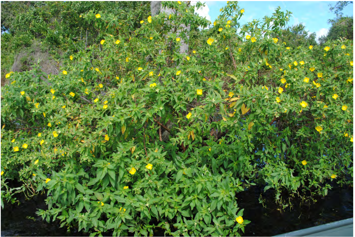
Both woody and water primrose (exotic and invasive) can grow in lakes and ponds. It looks attractive, but is hard to control. Continually treating with herbicides early after detection is the best and most economical way to manage it.