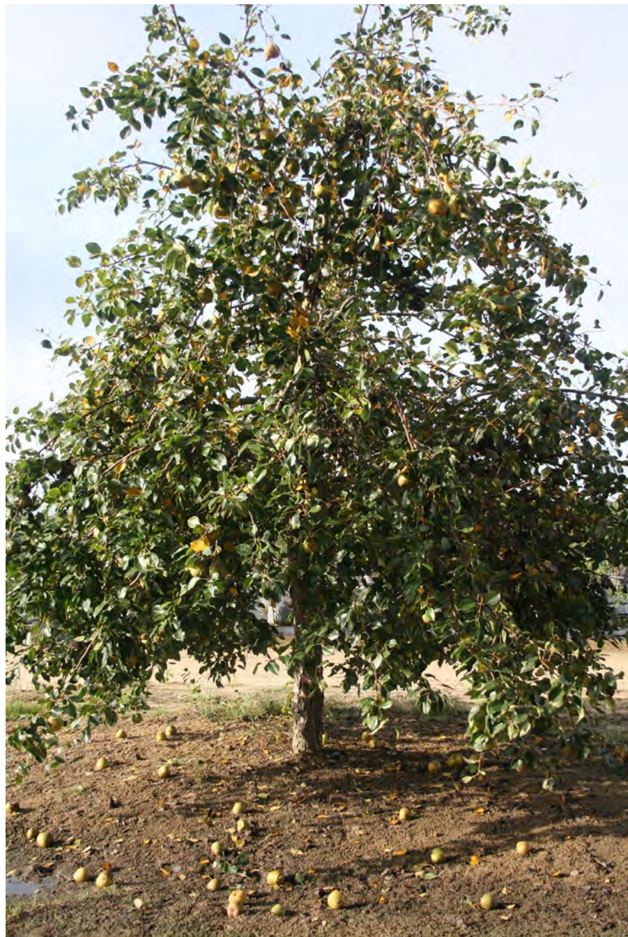
6 year old McKelvey Pear

How fast do you want the trees to mature? Yeah, I know, tomorrow. How can you get production sooner, plant more significant trees? Just don't go too large unless you plan to irrigate each tree. The more substantial tree that you plant,